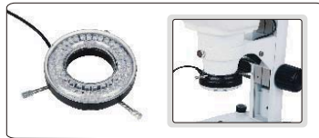
LED ring light (optional)